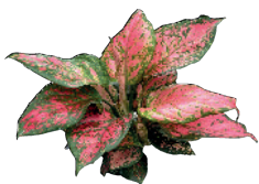
Aglaonema Lady Valentine